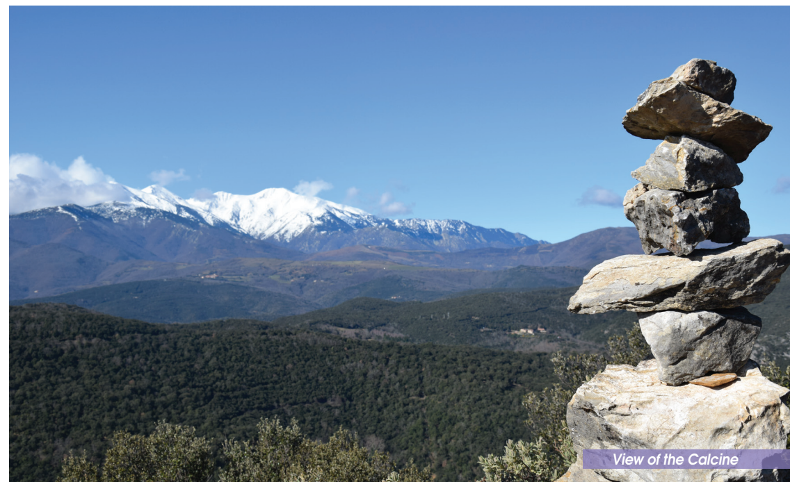
View of the Calcine