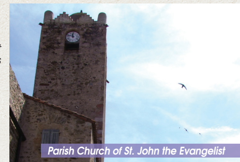
Parish Church of St. John the Evangelist

Romanesque church dating probably from the 12th century. It still contains a 12th century sarcophagus and four monuments of Holy Thursday