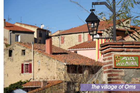
The village of Oms