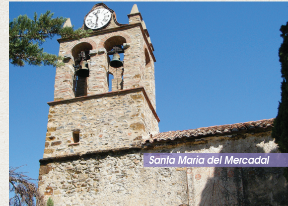
Santa Maria del Mercadal

Its building was wanted by the viscount of Castelnaud, Guillem V. It was built in the XIII th century by the farmers of Castelnaud. It's romanesque and gothic style. To must see : St Roch remarkable sculpture - contemporanean painting « a Christ in majesty » by Camille Descossy classified in january 2019 - XIII th century front door classified in 1973.