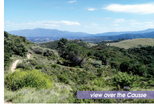
view over the Causse

Follow the marking until the village of Castelnaud and enjoy the visit of the village.