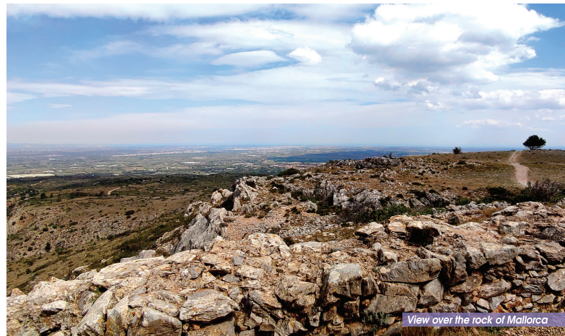
View over the rock of Mallorca