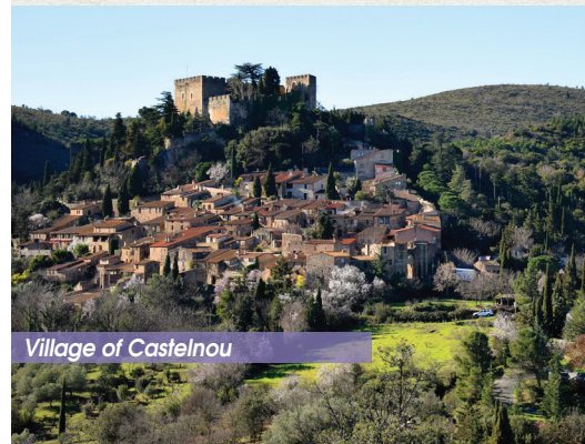
Village of Castelnaud